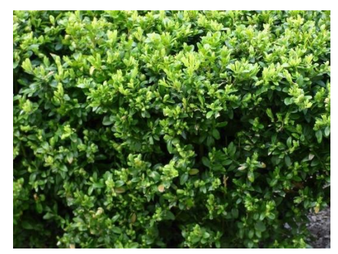
Clusia (also known as Pitch Apple)

The replacement hedge selected is called Clusia (image below) is an approved plant species of the Pelican Bay Landscape Design Committee and is extensively used throughout Pelican Bay. For visual reference purposes, it is the same species of hedge used by Jamestown which is the community located directly across the street on Oakmont Parkway from where our new hedge will be installed.